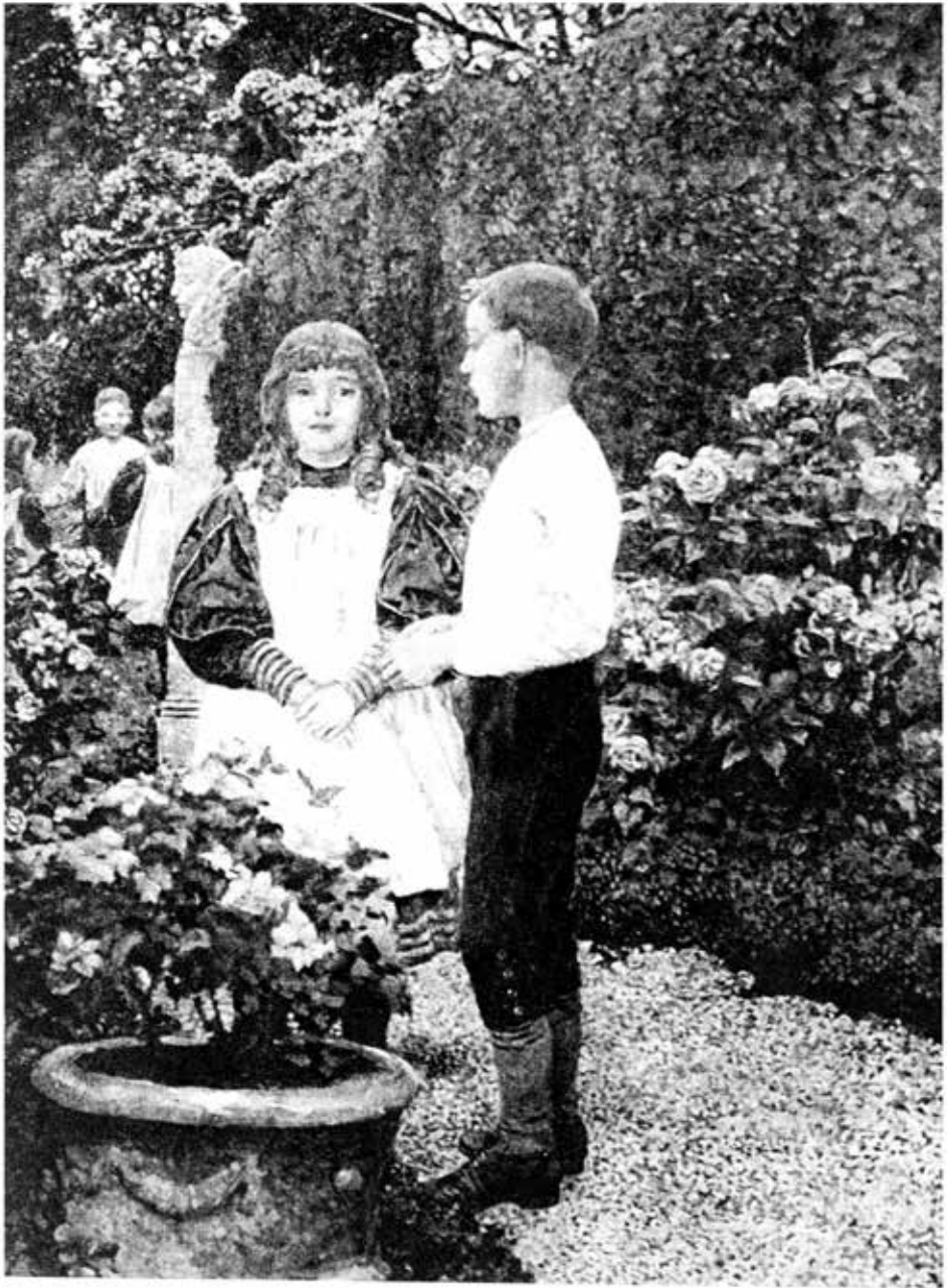
IN THE GARDEN BEHIND THE MOON.